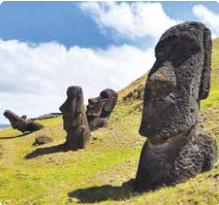
NOVA: Easter Island Origins

Miss Scarlet and The Duke on Masterpiece Eliza and Nash are still struggling to work