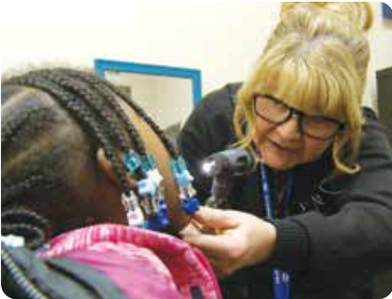
Nursing Students to Health (2/14)