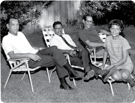
African Americans in California's Heartland – The Civil Rights Era (2/21)