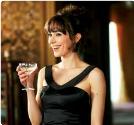
Ms. Fisher's Modern Murder Mysteries

Alibi A caterer returns to the Brentwood house after a party and walks in on Greg moving the dead body of his business partner (2/17 9PM). As Greg becomes more neurotic, Marcey uncovers some startling information in his books (2/17 9:50PM). Linda grows suspicious of Marcey, who abruptly quits her job and tries to warn Greg (2/17 10:45PM).