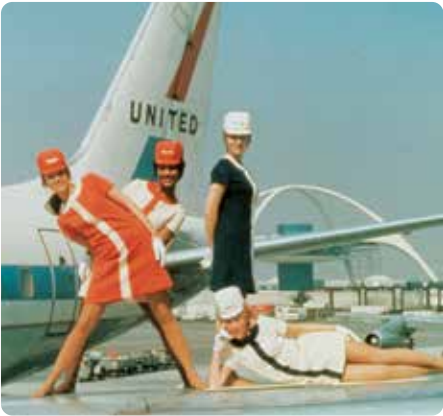
American Experience: Fly with Me

NOVA Discover the stories and theories behind the giant stone heads of Easter Island on Easter Island Origins (2/7 9PM). Follow the three