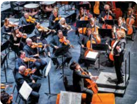
Rob at Home: Region Rising – The Power of Music (2/19)

Series sponsored by US Soy, Sustainable Agriculture Research and Education, and Rural Development Partners. Follow an urban couple as they realize their dream of growing saffron, one of the world's rarest spices, see a tomato farmer add solar panels to farmland, and tour a lumber mill in Alabama (2/5) . See why mandarins are exploding in popularity, visit a lettuce and herb farm, and meet a multi-generational family in Iowa growing soybeans (2/12) . Travel to North Dakota where scientists are developing new kinds of sunflower seed snacks, delve into research on building a better tomato, explore the National Seed Bank, and see how soil is being improved for better crops (2/19) .