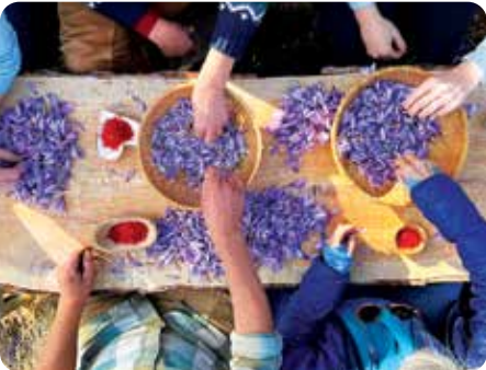
America's Heartland (2/5)