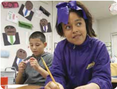
Kids Are Just Kids (2/21)