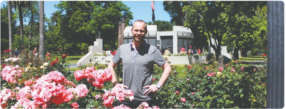
Sacramento's Historic Downtown

Getting There - Transit in the Sacramento Region takes an in-depth look at transportation challenges in our expanding region and the trends that could shape how we'll get where we're going (6/7). Episode sponsored by Siemens and R&P Jorjorian. The Great Vacation Squeeze examines why vacations are crucial to wellbeing, and why Americans take shorter vacations (6/14). The Boomer's Guide to Growing Older explores the challenges faced by baby boomers as they grapple with their own health issues and care for their aging parents and spouses, and examines resources to help them (6/21). Episode sponsored by UC Davis Health. Stand and Salute explores the challenges American service members face, before and after active duty, and the resources available for them and their families (6/28).