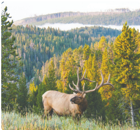
Great Yellowstone Thaw