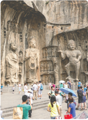
The Story of China