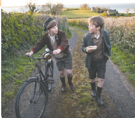
My Mother and Other Strangers on MASTERPIECE