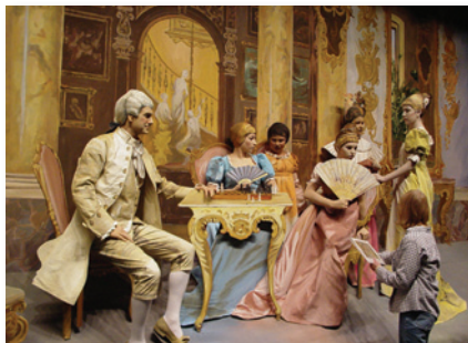
Volunteers portray famous works of art at the Pageant of the Masters in Laguna Beach

Our package includes two nights at the Newport Marriott Hotel , tickets to the pageant, a pre-show tour and dinner, plus a post-show lecture the following morning to learn more about how it is all done. 3 meals, added attractions and airfare included. $1495 p.p./dbl.occ., $1675 single