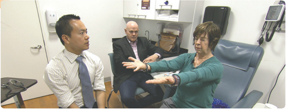
The Boomer's Guide to Growing Older