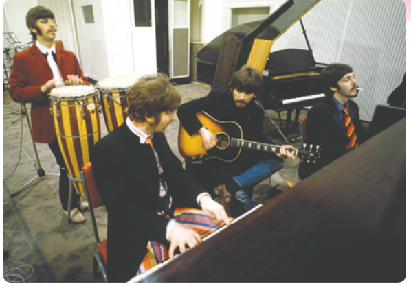
Sgt. Pepper's Musical Revolution

the inside story of the creation of ISIS, and explores how the U.S. missed warning signs (6/27 10PM).